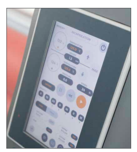
Control keyboard for all the working functions