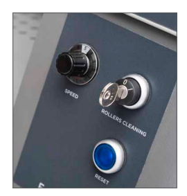
Electronic working speed adjustment by potentiometer

Double safety photosensitive cell avoiding finger crushing and emergency button